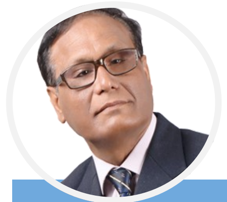
Dr Sanjay Agrawal

Nipah virus is a newly emergent, bat-borne paramyxovirus found in Southeast Asia that causes encephalitis in humans with 40 to 90% lethality. There are no vaccines or antiviral therapeutics approved for human use. Nipah virus has a single-stranded, negative-sense RNA genome that is encapsidated by the nucleoprotein (N) and transcribed and replicated by the polymerase protein (L). The phosphoprotein (P) plays an essential role as a polymerase cofactor, enhancing polymerase processivity and allowing the encapsidation of the newly synthesized viral genomes and antigenomes. In these roles, P serves as a tether between the polymerase and its template and also serves as a chaperone for nascent, RNA-free N, termed N o , preventing it from nonspecifically binding host RNA.